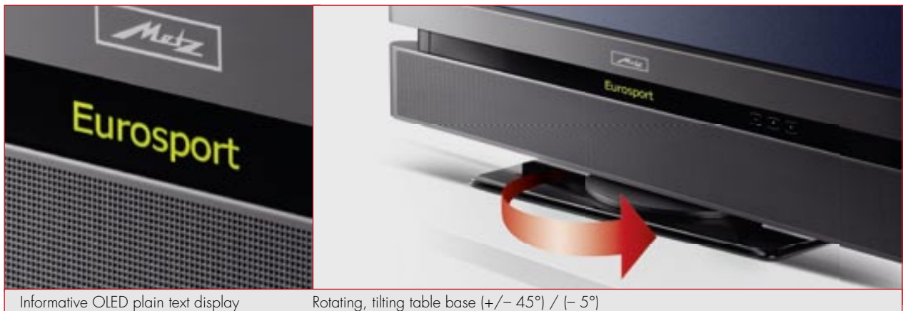
Informative OLED plain text display